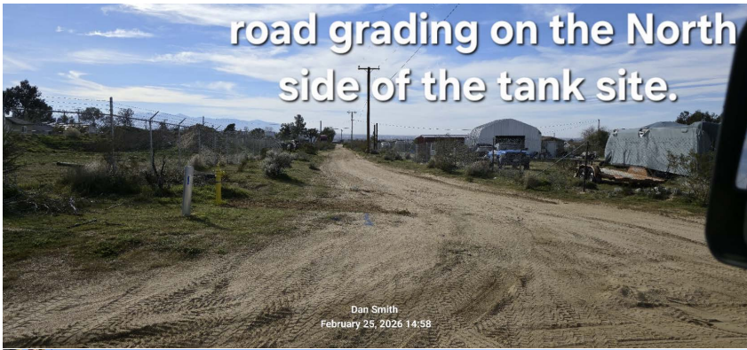
road grading on the North side of the tank site.