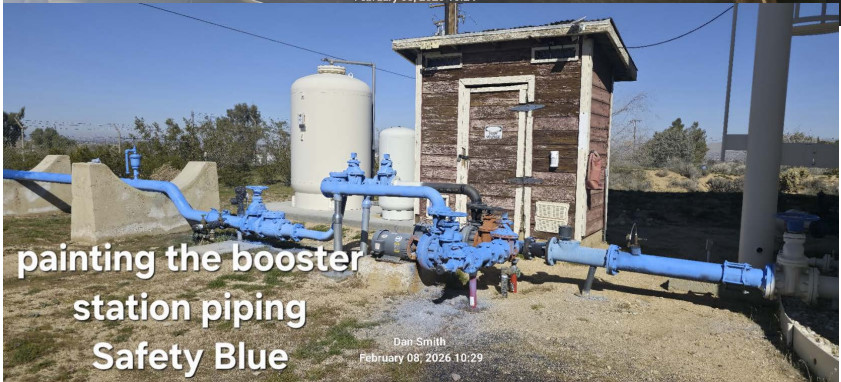
painting the booster station piping Safety Blue