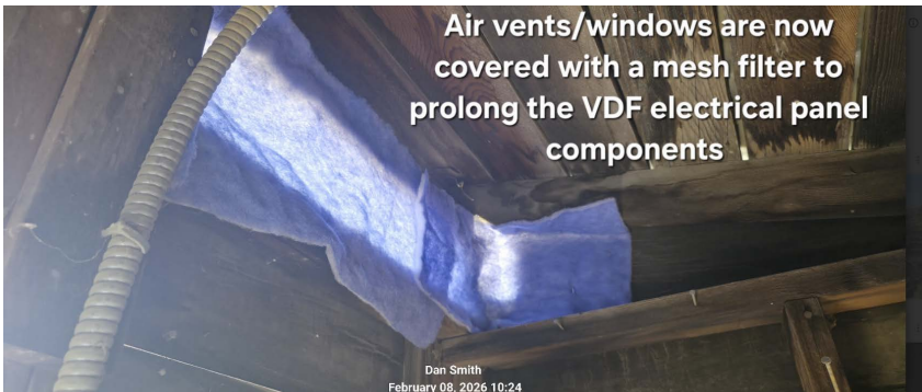
Air vents/windows are now covered with a mesh filter to prolong the VDF electrical panel components