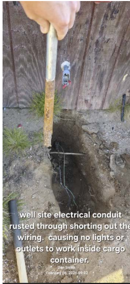
well site electrical conduit rusted through shorting out the wiring, causing no lights or outlets to work inside cargo container.